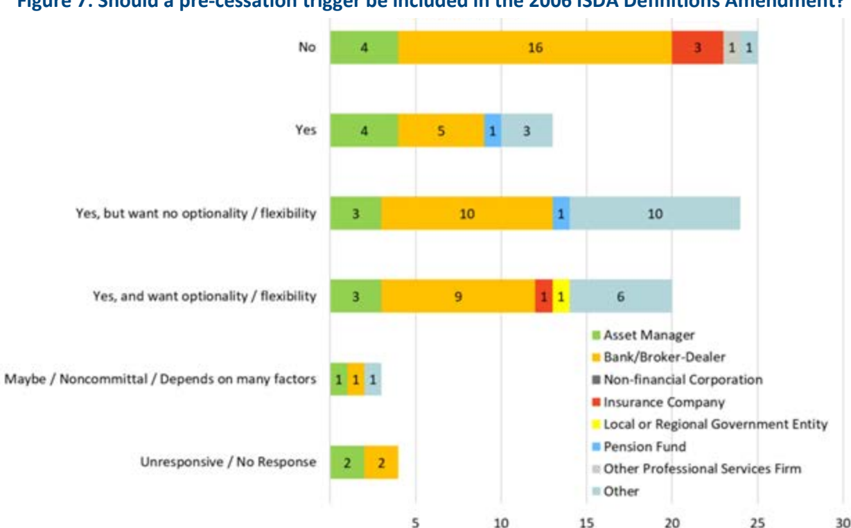
Figure 7: Should a pre-cessation trigger be included in the 2006 ISDA Definitions Amendment?